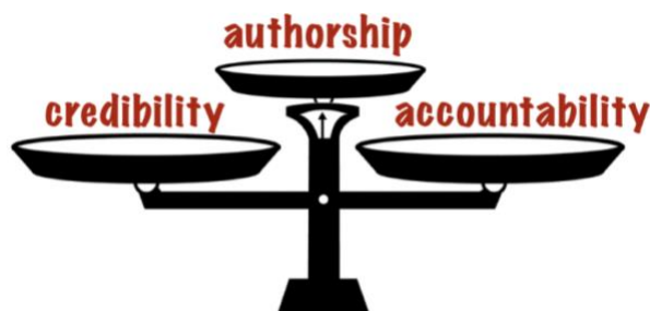
Figure 1. Authorship equation

Researchers should familiarize themselves with proper authorship practices in order to protect their copyrights from research fraud. Moreover, researchers should be aware of the authorship practices within their own disciplines and should always abide by the requirements stipulated by a prospective publishing journal. As some journals require processing and/or publication fees, financial issues should be settled and agreed upon early in the research process to avert subsequent disputes. The Committee on Publication Ethics (COPE) has a guide to help researchers navigate authorship issues (6). Detailed management of authorship disputes is beyond the scope of this article.